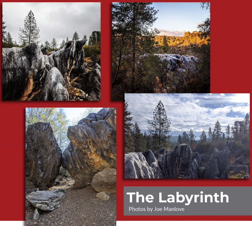
The Labyrinth

Produced by the Columbia College Department of External Initiatives